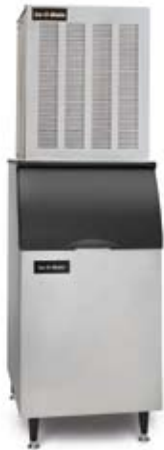
MFI 500 on B42 BIN

MODULAR MFI Series modular Flake ice machines feature the benefits of our SystemSafe load-monitoring control board that continually checks the workload on the gearbox. Additionally, the durable stainless steel evaporator, auger and in-line direct drive train will help reduce breakdowns.