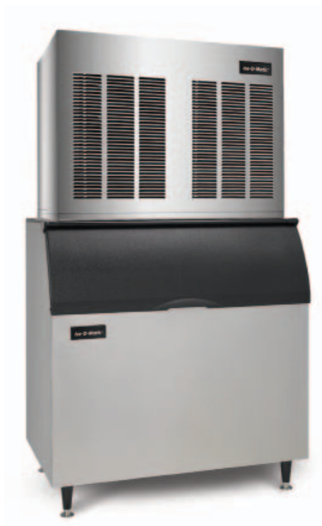
MFI2406 ON BIOO