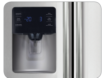
External Filtered Water and Ice Dispenser