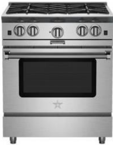
Model Shown: BSP304B