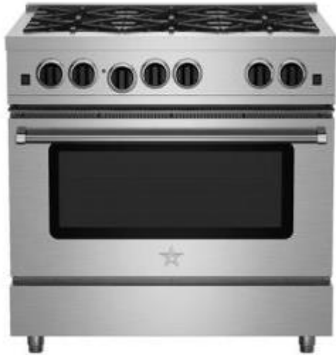
Model Shown: RCS36SBV2