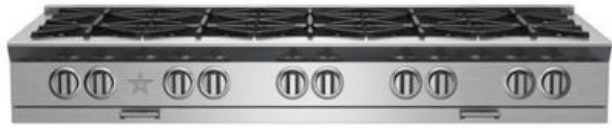
Model Shown: BSPRT6010B