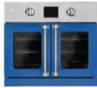
30" French Doors

Features a built-in artisan baking stone with precise temperature control, touch screen control panel with 12 cooking modes (including StoneBake™, True European Convection & Sabbath), Infrared Broiler, eco-friendly Continu Clean™ and an extra-large cavity that fits a commercial size baking sheet.