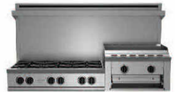
60" Heritage Classic