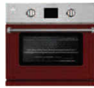
30" Drop Down Door