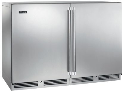
All Solid Door Model