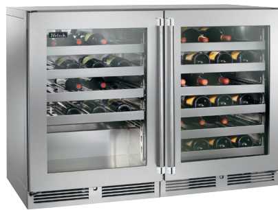
All Glass Door Model