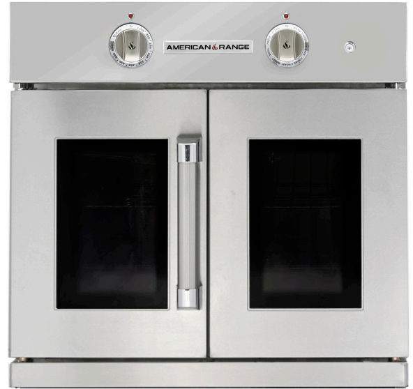
SEF-30 SHOWN IN STAINLESS STEEL, AVAILABLE IN ANY RAL COLOR