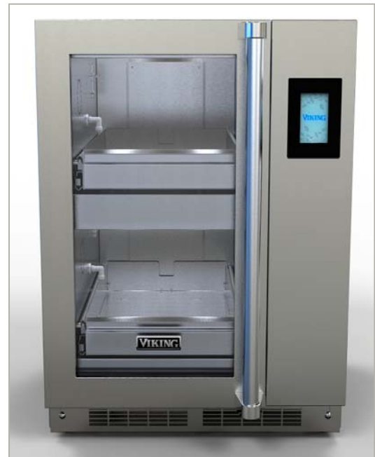
GCV12LSS (left hinged door)