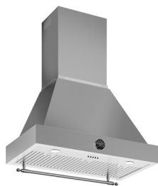
K36HERTX + KC36HERTX Stainless steel canopy