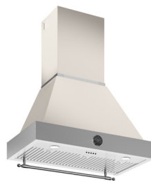
K36HERTX + KC36HERTAV Ivory gloss canopy