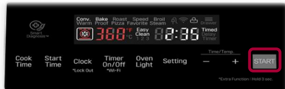
Range Control Panel

You can use the SmartThinQ™ app for wi-fi enabled models to turn on Sabbath Mode. Sabbath Mode will be maintained even after a power outage, but the oven will be off.