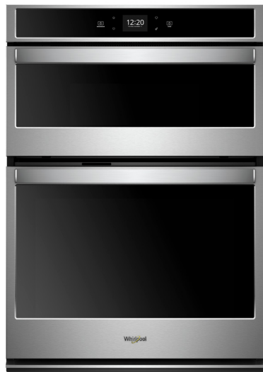
Stainless Steel WOC54EC7HS