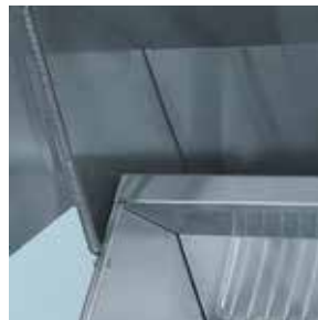
LYNX HOOD ASSIST

FOR MORE INFORMATION ON LYNX PROFESSIONAL PRODUCT FEATURES, PLEASE VISIT LYNXGRILLS.COM