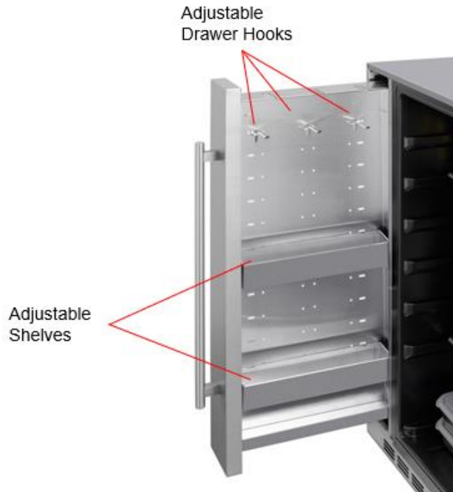
Side Compartment Detail