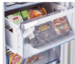
Multiple storage drawers for easy access