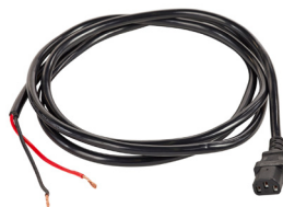
8ft electrical wire cut end included