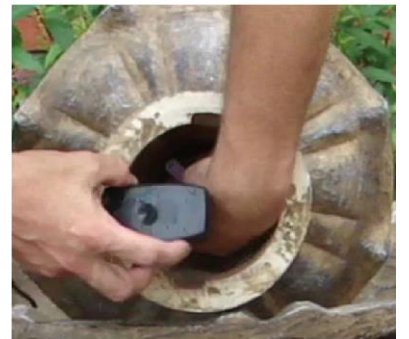
Step 6 - Attach water hose to pump