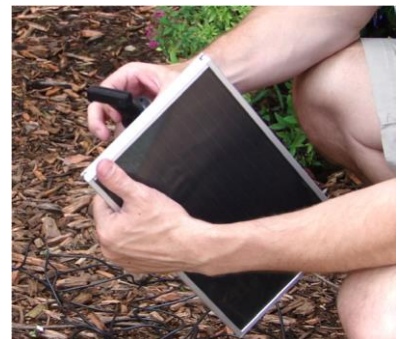
Step 9- Assemble solar panel