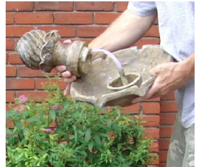
Step 3 - Feed water tube through 2nd tier