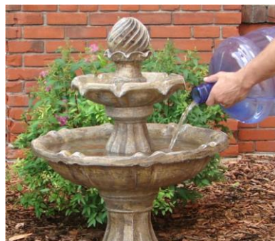
Step 8- Fill both tiers with water.