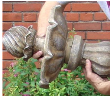
Step 5 - Twist and lock 2 nd tier to small pedestal.