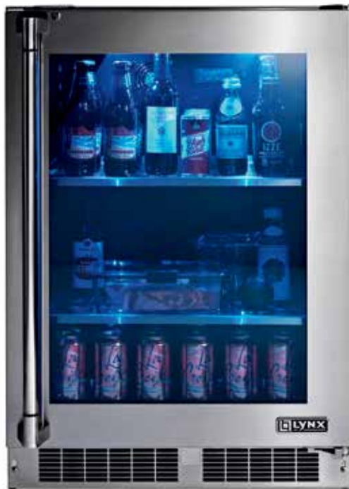
Shown: LN24REF w/ Glass Door