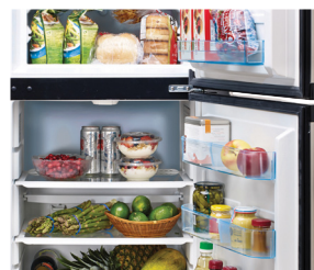
The world's leading DC compressor