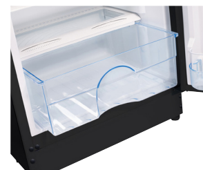
4 glass shelves 1 crisper drawer