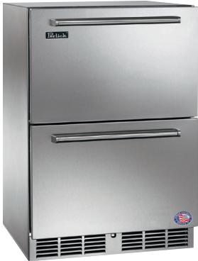
Freezer/Refrigerator Drawers HP24FS-5