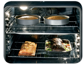
Flex Duo™ Oven