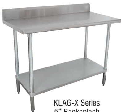
KLAG-X Series 5" Backsplash