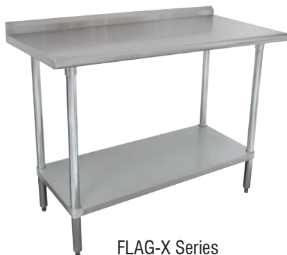
FLAG-X Series 1 1/2" Backsplash