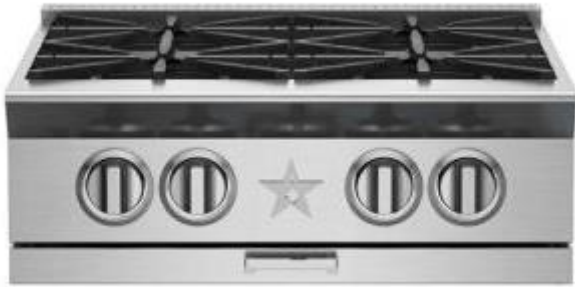
Model Shown: BSPRT244B