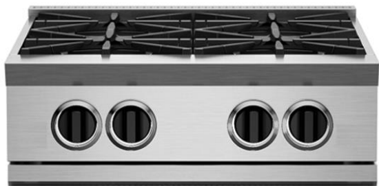
Model Shown: RGTNB244BV2