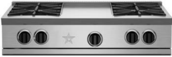
Model Shown: RGTNB364GV2