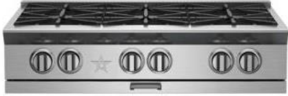
Model Shown: BSPRT366B