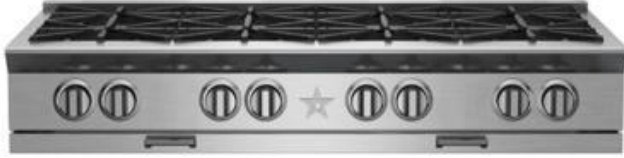
Model Shown: BSPRT488B