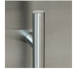
Slim Designer Handle Shown (MP36RA2RS)