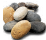
Natural Stone Kit