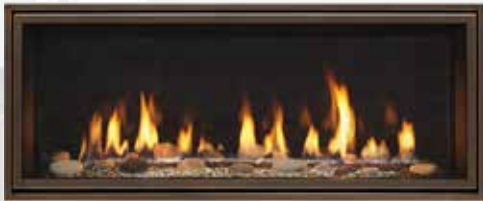
Clean Face Trim (available in Black, Bronze and Pewter)