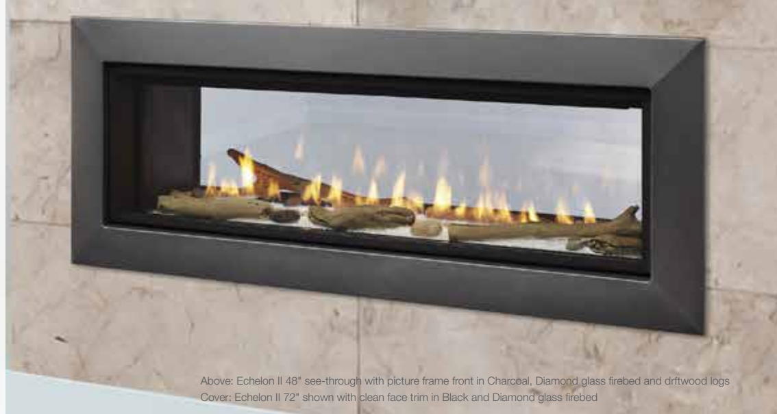
Above: Echelon II 48" see-through with picture frame front in Charcoal, Diamond glass firebed and driftwood logs Cover: Echelon II 72" shown with clean face trim in Black and Diamond glass firebed