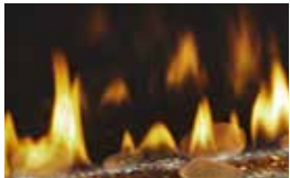
Reflective Black Glass Panels