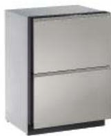
INTEGRATED SOLID (STAINLESS HANDLELESS PANEL)*