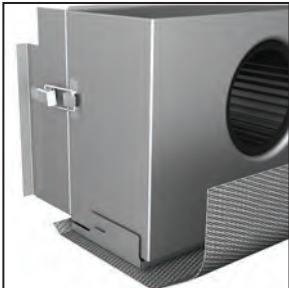
Removable blower Housing