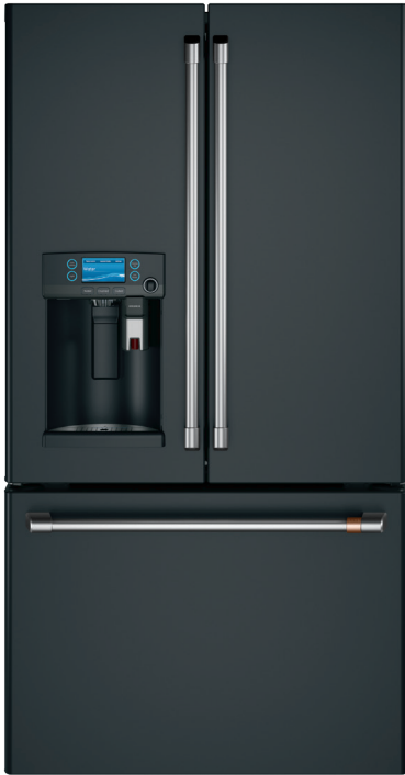
CFE28UP3MD1 Matte Black with Brushed Stainless handles