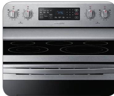
Stainless Steel Cooktop

Fingerprint Resistant Black Stainless Steel