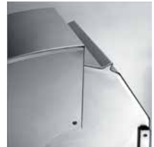
HEAT STABILIZING DESIGN