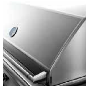
SEAMLESS WELDED CONSTRUCTION