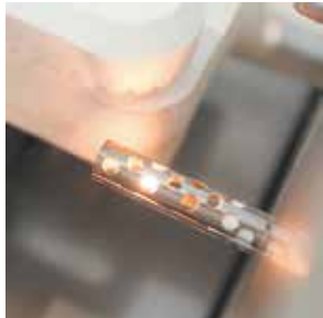
HOT SURFACE IGNITION