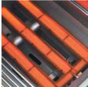
TRIDENT™ INFRARED BURNER

Our unrelenting attention to detail and our passion for innovation have fostered the stunning features that define the Lynx Professional Series. These features begin with meticulous hand-crafted excellence, and they culminate in powerful capabilities that give you precision control.