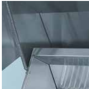
LYNX HOOD ASSIST

FOR MORE INFORMATION ON LYNX PROFESSIONAL PRODUCT FEATURES, PLEASE VISIT LYNXGRILLS.COM