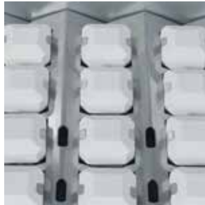
CERAMIC RADIANT BRIQUETTES