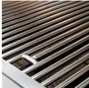
EXPANSIVE GRILLING SURFACE