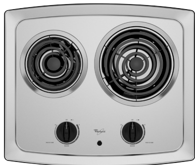
Stainless Steel RCS2012RS