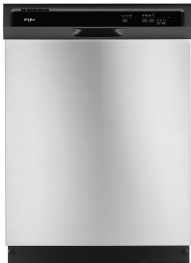
Stainless Steel WDF330PAHS