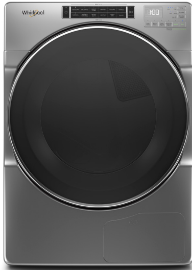
Chrome Shadow WHD862CHC