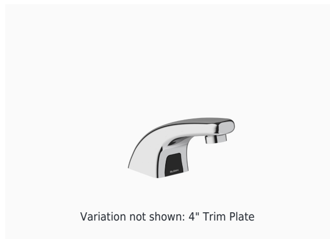
Variation not shown: 4" Trim Plate