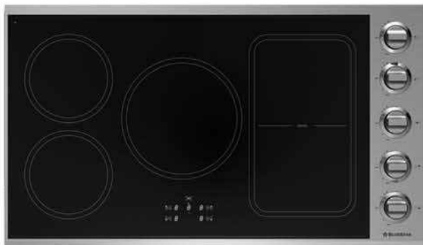
36" TURN Induction Cooktop